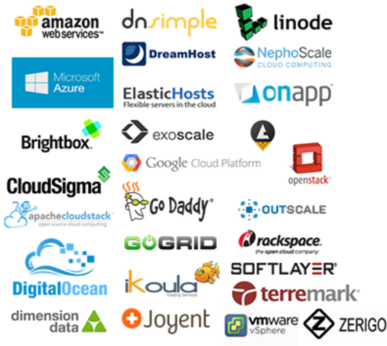
Fig. 1: A subset of supported providers in Libcloud.