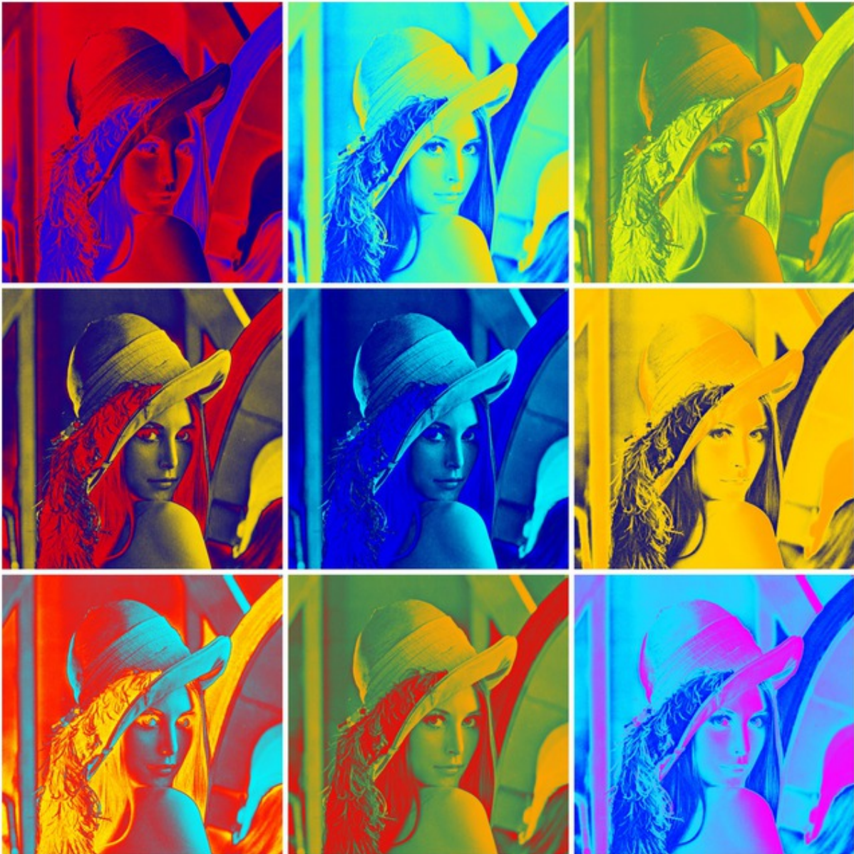
Fig. 2.2: Warholized version of Lena